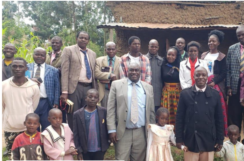
Kisii Church midweek service