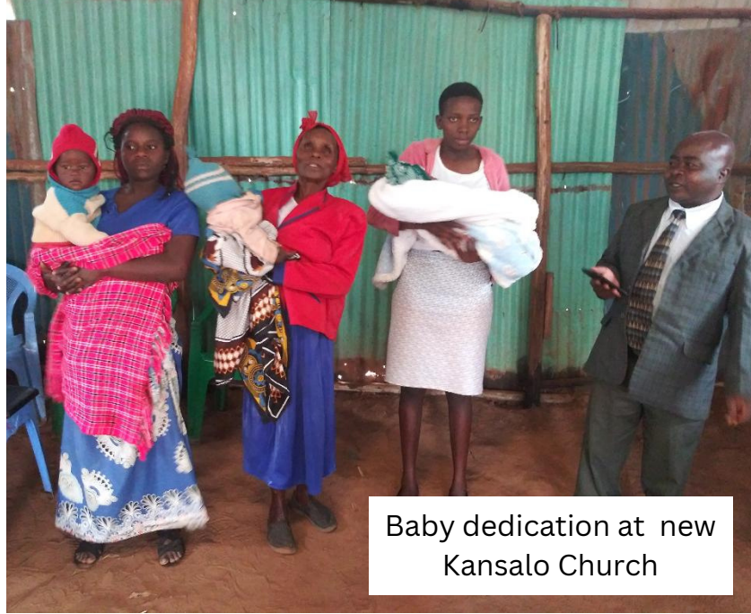
Baby dedication at new Kansalo Church