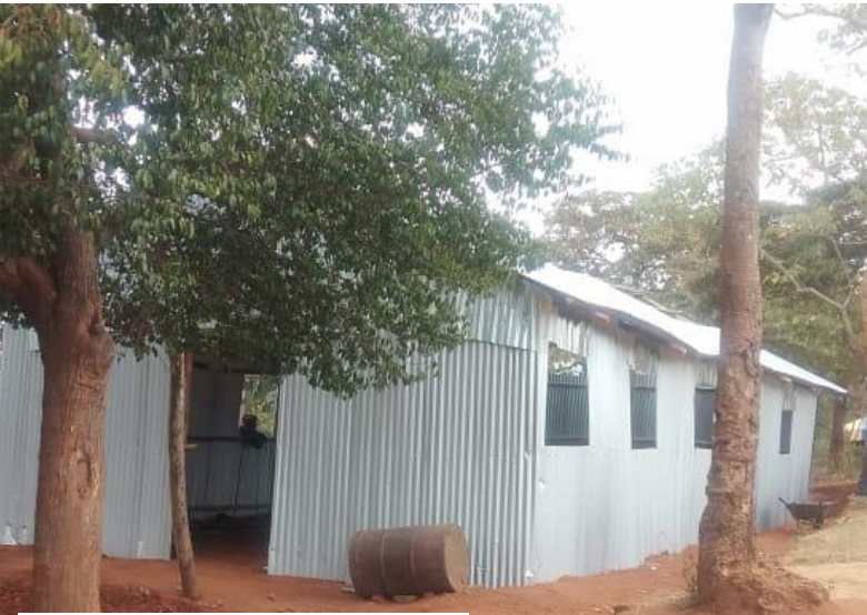
new church at Ngini/Kangundo