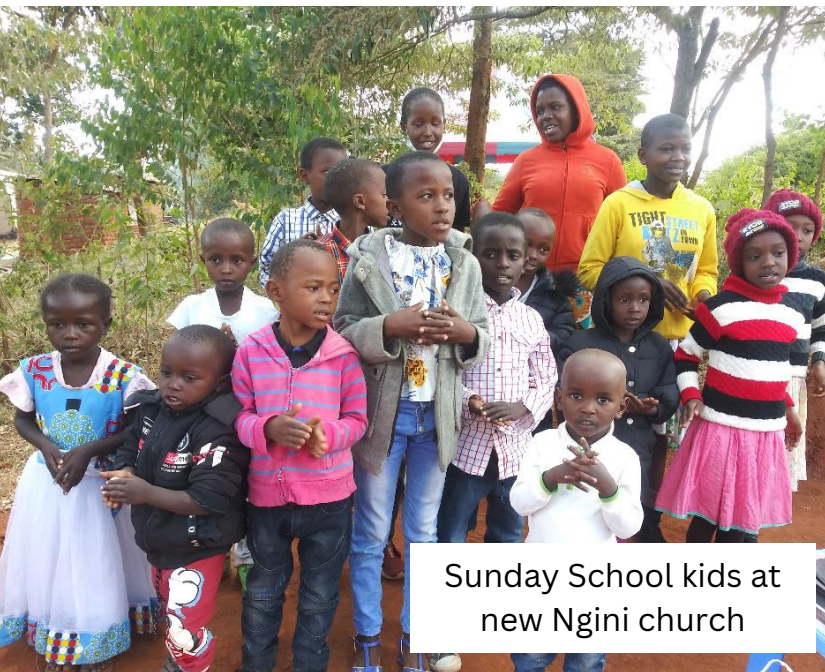
Sunday School kids at new Ngini church